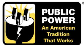
Public Power Week • October 5-11, 2008

Algona Municipal Utilities, along with more than 2,000 other electric utili-