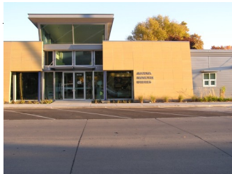
Algona Municipal Utilities

placing utilities underground increases reliability and reduces expenses to AMU and our customers over time. Other reasons for the upgrade include the National Electric Safety Code requires meters to be accessible, the National and State Electric Codes require proper protection for electric circuits, City Ordinance requires sump pumps to be connected to the storm sewer, and alley safety will be increased by eliminating surface drainage from roof drains. The Downtown Alley Project is expected to start in May 2011 with completion set for July 2012.