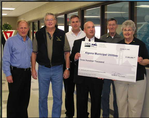
Algona Family YMCA Aquatic Center

Algona Municipal Utilities is committed to improving the economic growth, community vitality and overall sustainability of the Algona area.